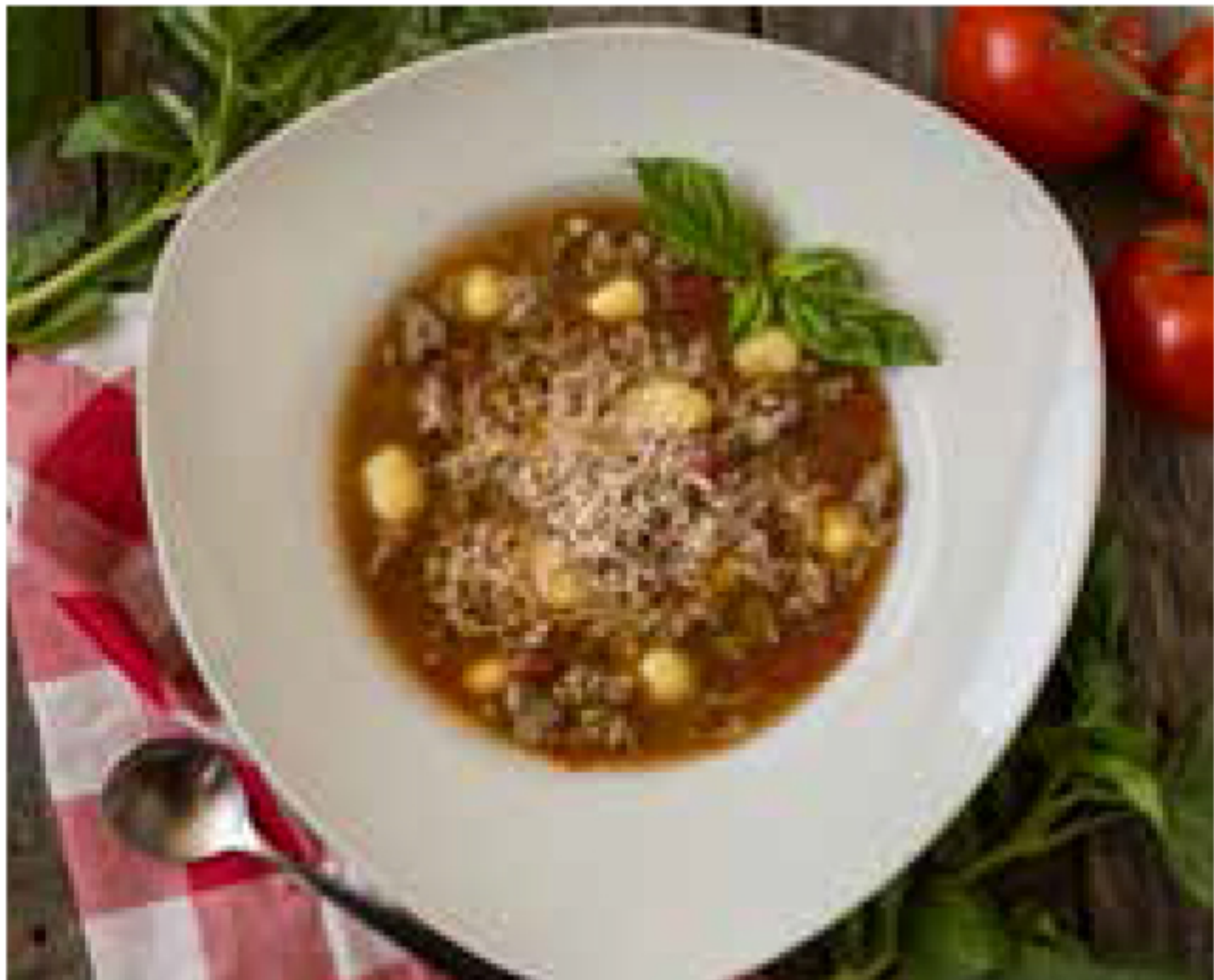
Italian Sausage-Gnocchi Soup