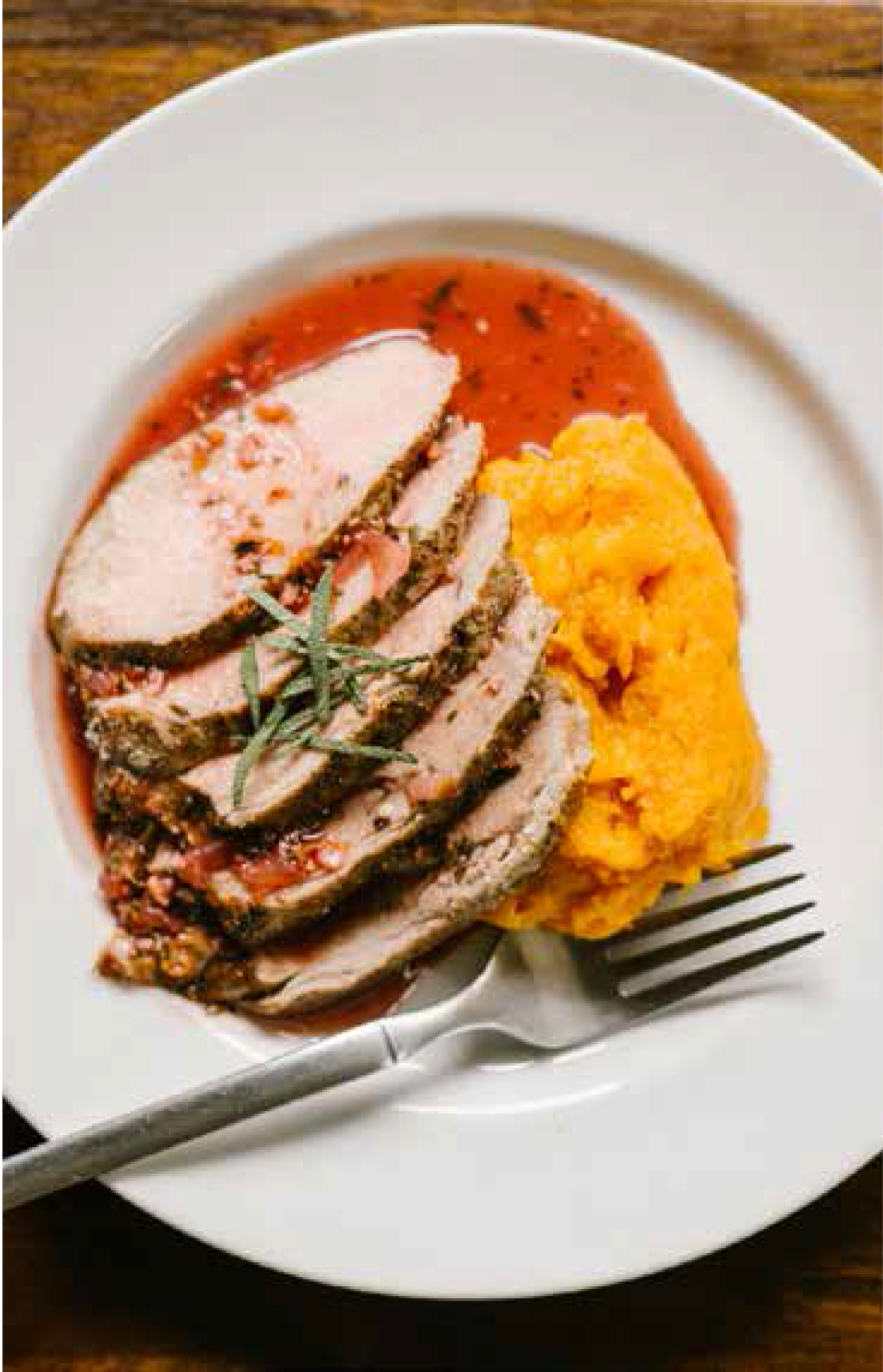
Pork with Cranberry-Port Sauce with Mashed Sweet Potatoes