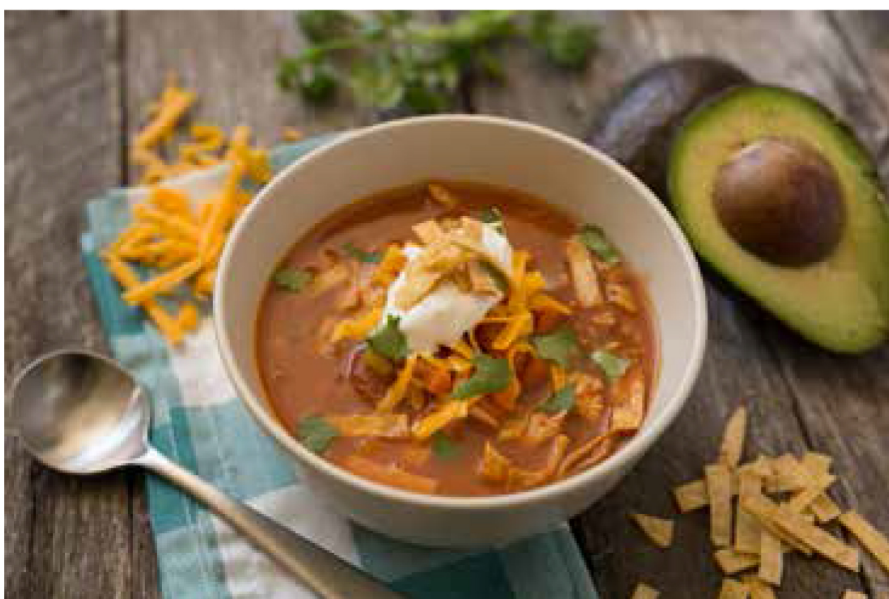
Mexican-Style Chicken Soup