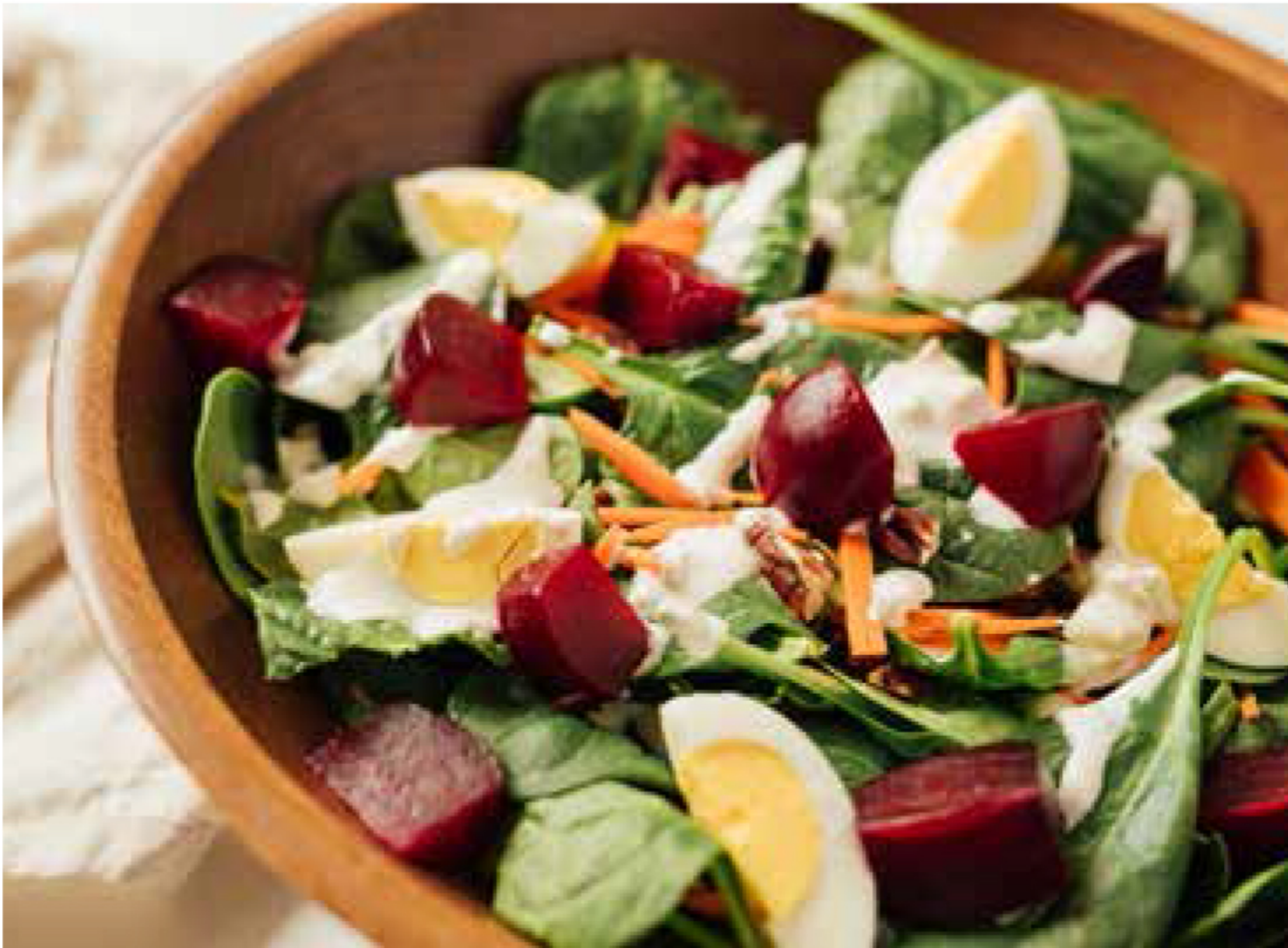
Loaded Spinach Salad