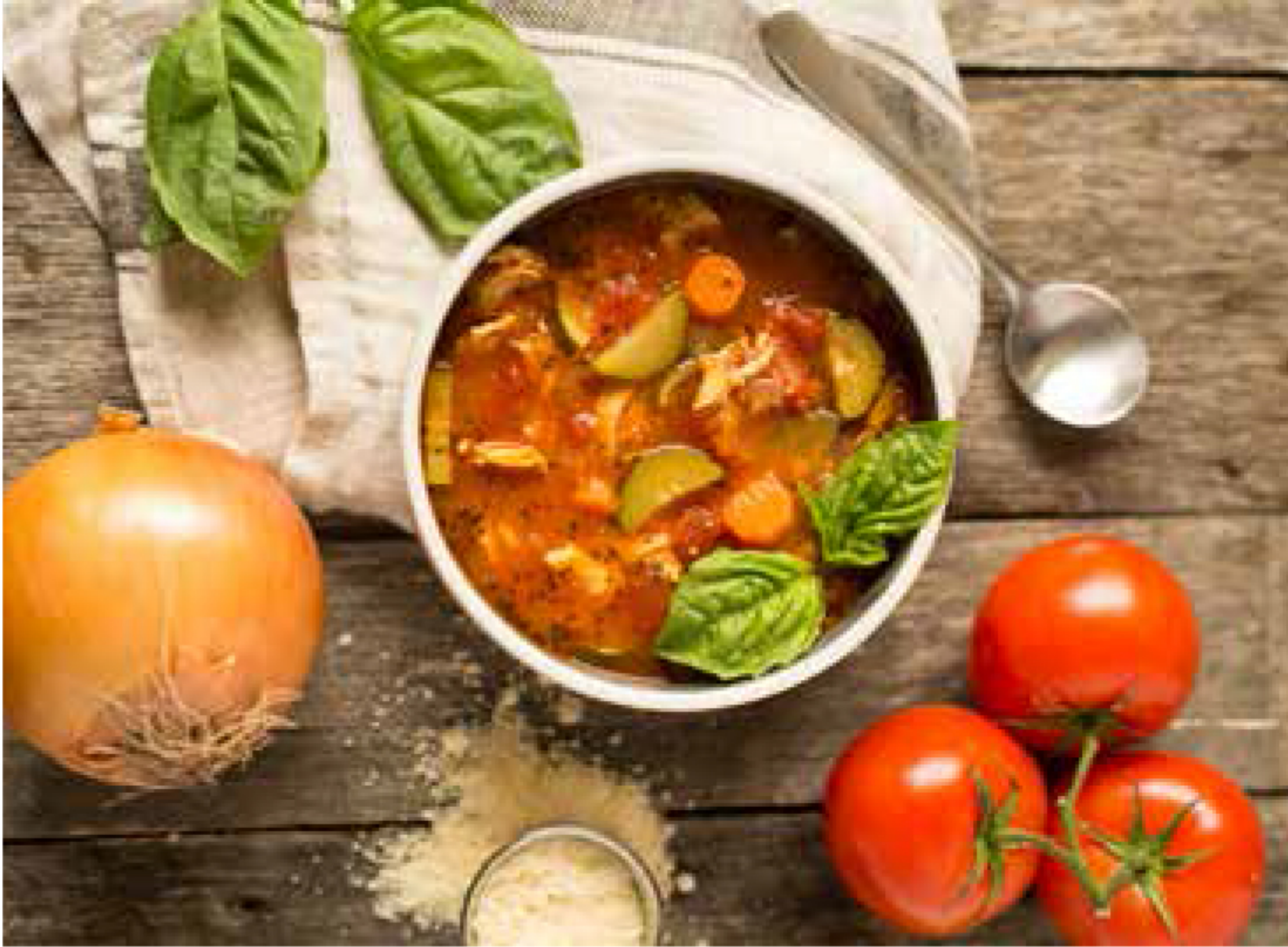
Italian-Style Chicken and Vegetable Soup