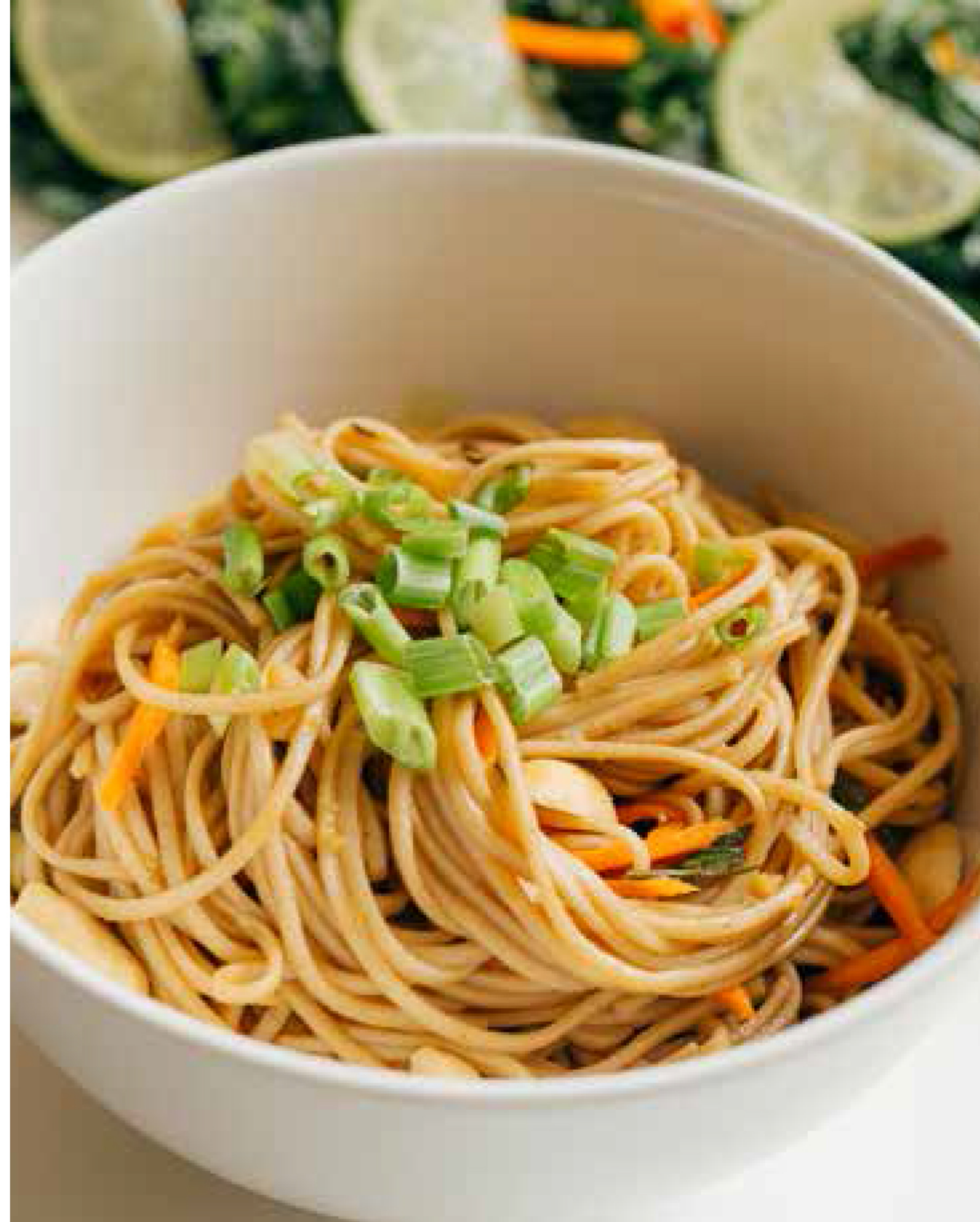
Sesame Noodles with Thai Basil and Peanuts with Asian-Style Kale Salad with Tamari-Ginger Vinaigrette

met. Starting out with a single client, they now bring dinner to the table for over 100 families per month. Unlike other personal chef companies, there is no need to clear your calendar, straighten your counter, or lock up the dog. The Wandering Gourmet prepares from-scratch meals in their commercial kitchen, avoiding unused grocery waste and unnecessary specialty ingredients cluttering cabinets. The Wandering Gourmet punctuates their meal plans as all great dinners should be – with delicious desserts, on the house.